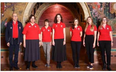
Team Salcomaggiore 2022