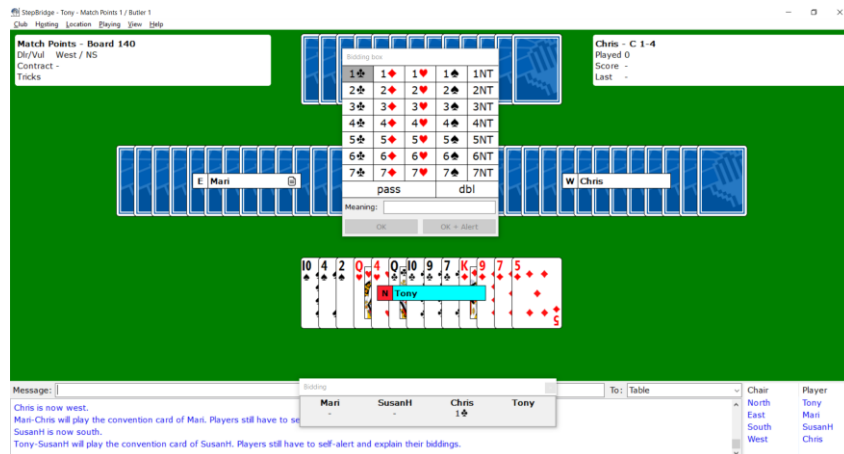
Board 140 – You are North (bottom of screen) . North/South vul ('red tag against name') showing North (blue name) at his turn to bid (the bidding tray and the auction panel have been repositioned). The bidding tray will disappear when North has made his bid. East/West are using East's system card (icon against name). North/South are using South's system card (icon temporarily hidden).

At your turn to bid, you are presented with a bidding tray from which you select your bid – click and then press 'OK' (alternatively you can just double-click the bid). The system prevents you from making an invalid bid.