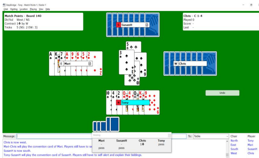
Board 140 – You are North. West is playing in 1♣, and has won 3 tricks, lost 2, and the 6 th . trick is just being finished (the auction tray is shown, but can optionally be hidden during the play)

At any time during the play, the declarer can claim some or all of the remaining tricks (press ‘claim’ or F2). Unless under time pressure, it’s usually better to play out the hand as normal – saves confusion. If a defender challenges declarer’s claim, the Director should be called. He may then give an adjusted score (as is the case with FtoF bridge). Note – a defender cannot claim nor concede. You can review the last trick played at your turn to play by right-clicking the mouse and choosing the option, or pressing F4.